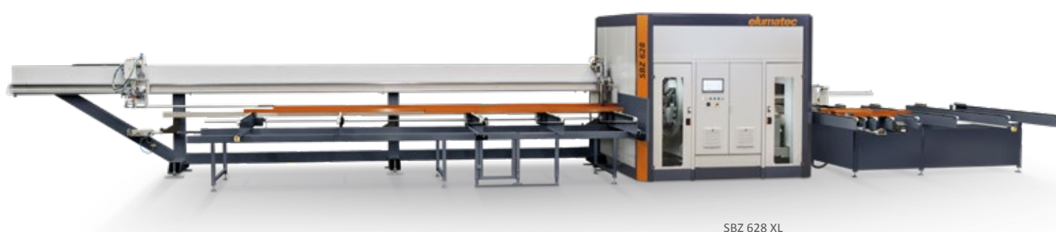
SBZ 628 XL