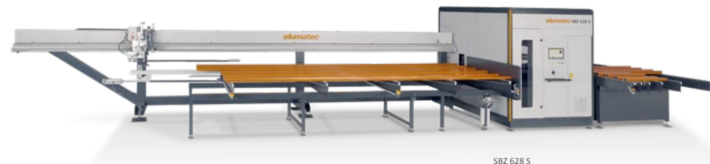
SBZ 628 S