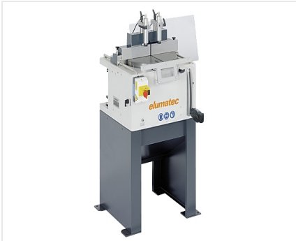
Table saw TS 161/21