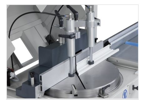
Table saw TS 161/30