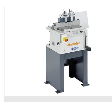
Table saw TS 161/21