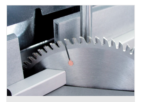
Table saw TS 161/00