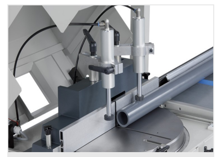
Table saw TS 161/30