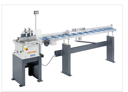
Table saw TS 161/21 + MMS 200