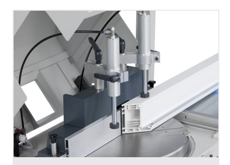
Table saw TS 161/30