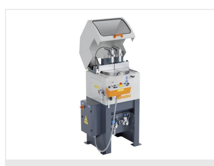
Table saw TS 161/30