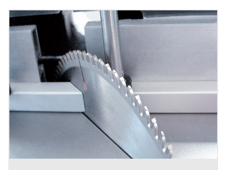
Table saw TS 161/00