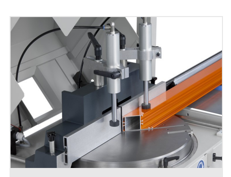
Table saw TS 161/30