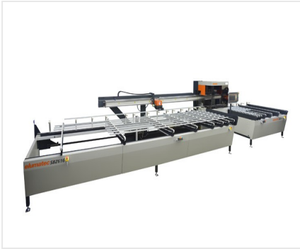
Cut-to-length centre SBZ 616/02