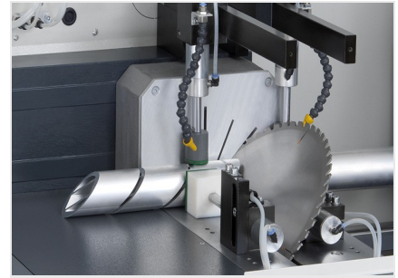
Automatic saw SAS 142/43