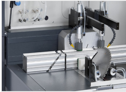
Automatic saw SAS 142/43