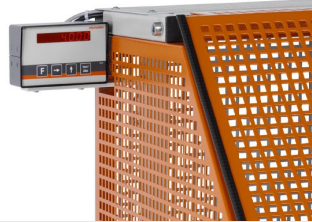
Automatic saw SA 73/36