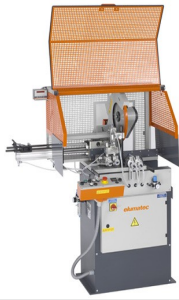
Automatic saw SA 73/36