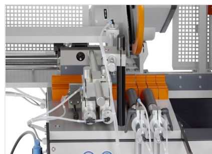
Automatic saw SA 73/36