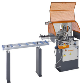
Automatic saw SA 73/36