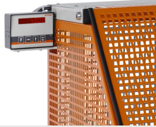
Automatic saw SA 73/36