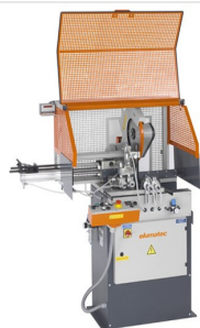
Automatic saw SA 73/36