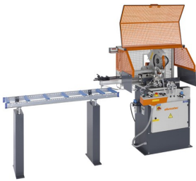
Automatic saw SA 73/36