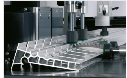
Automatic saw SA 142/38