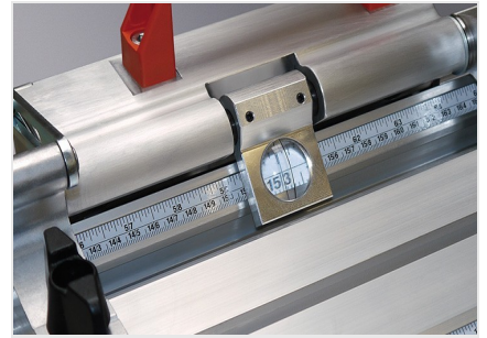
Stop and measuring system MMS 200