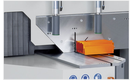
Mitre saw MGS 105