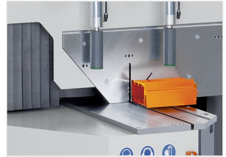
Mitre saw MGS 105