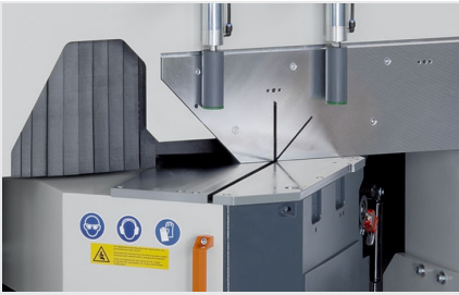
Mitre saw MGS 105