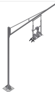
Equipment holder G 3000 + Steel column S 3000