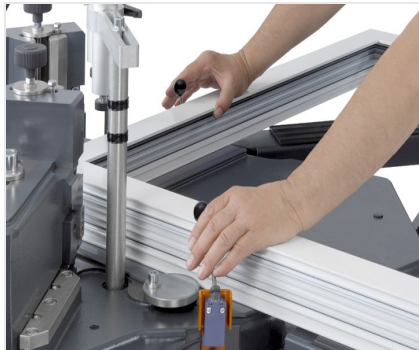
Corner crimper EP 124/20 2-hand operation