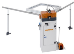
Corner crimper EP 120