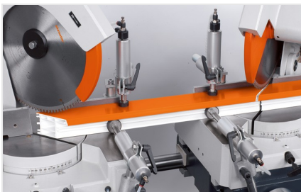
Double mitre saw DG 79