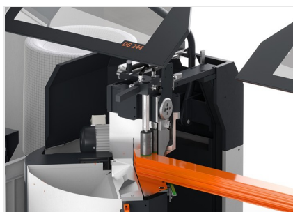
Double mitre saw DG 104 Short stop