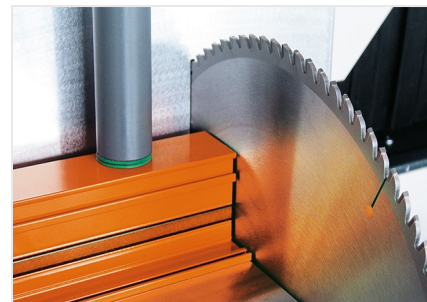
Double mitre saw DG 104