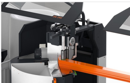
Double mitre saw DG 104 Short stop