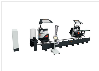
Double mitre saw DG 104 + E 590