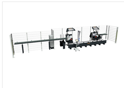
Double mitre saw DG 104 + special accessories