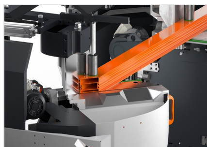
Double mitre saw DG 104