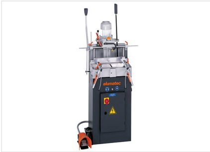
1-spindle copy router AS 70/44