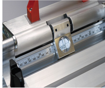
Length stop and measuring system AMS 200