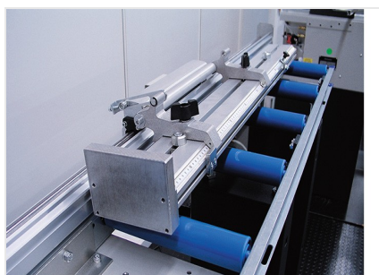
Length stop and measuring system AMS 200