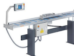
Length stop and measuring system AMS 200 + E 355