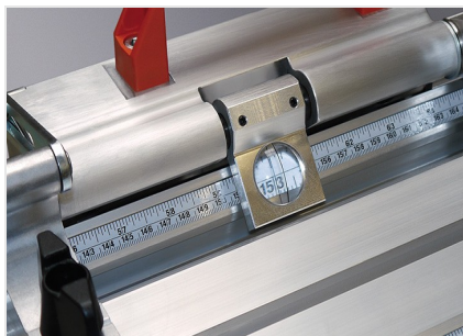
Length stop and measuring system AMS 200