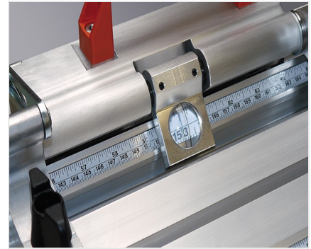
Length stop and measuring system AMS 200