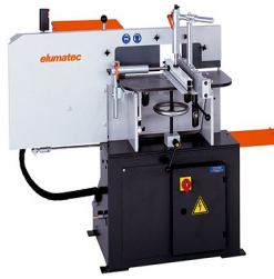
End milling machine AF 222/02