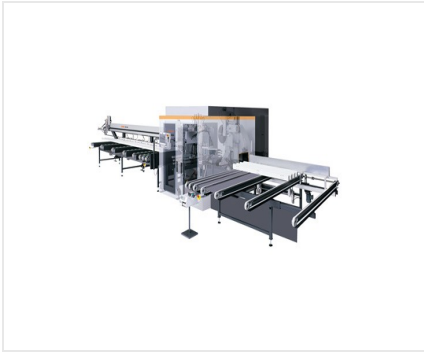
Profile machining centre SBZ 631