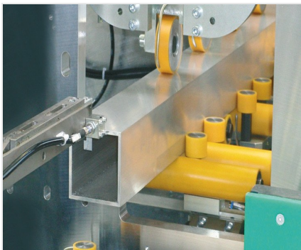
Profile machining centre SBZ 631