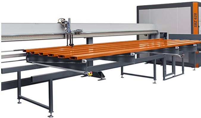
Infeed loading magazine