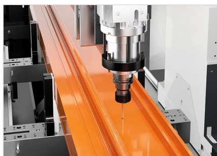
Profile Machining Centre SBZ 141