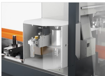
Profile Machining Centre SBZ 141