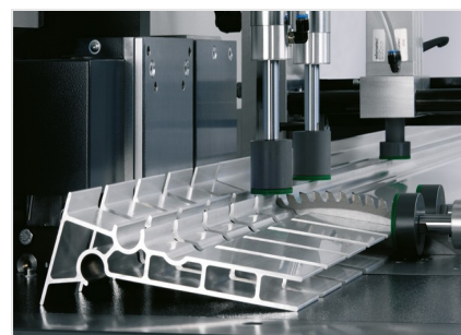
Automatic saw SAS 142/44