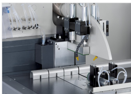
Automatic saw SAS 142/44