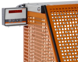
Automatic saw SA 73/36