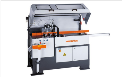
Automatic saw SA 142/37