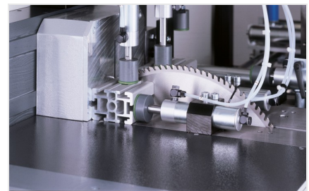
Automatic saw SA 142/37