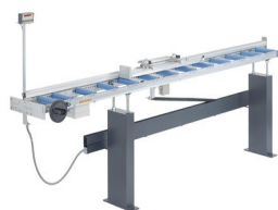
Stop and measurement system MMS 200