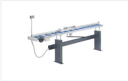
Stop and measurement system MMS 200