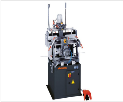
2-spindle copy router KF 78/23