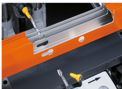
3-spindle copy router KF 178/10