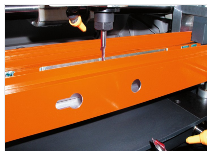
3-spindle copy router KF 178/10