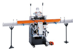
3-spindle copy router KF 178/10