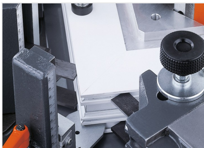
Corner crimper EP 124