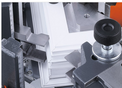
Corner crimper EP 124