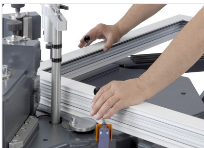
Corner crimper EP 124/20 2-hand operation