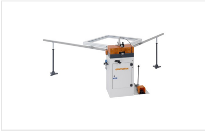
Corner crimper EP 120