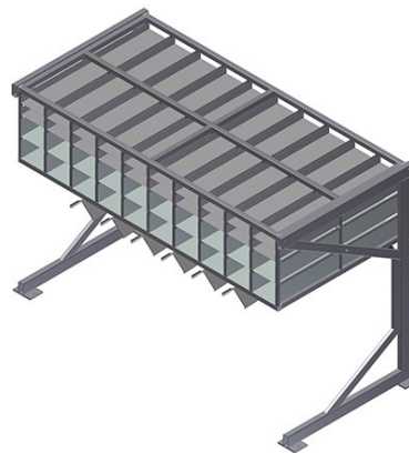
Hardware rack BR 40