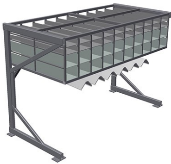
Hardware rack BR 40