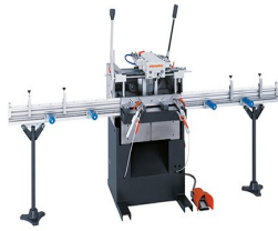
1-spindle copy router AS 170/10