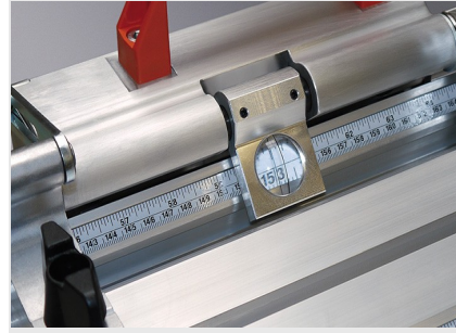
Length stop and measuring system AMS 200