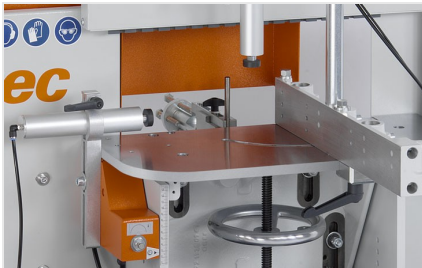
End milling machine AF 223/01