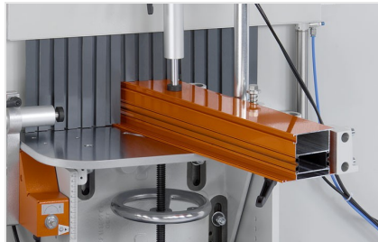
End milling machine AF 223/01