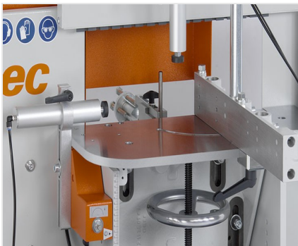
End milling machine AF 223/01