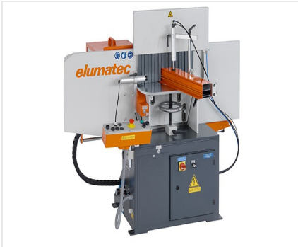
End milling machine AF 223/01